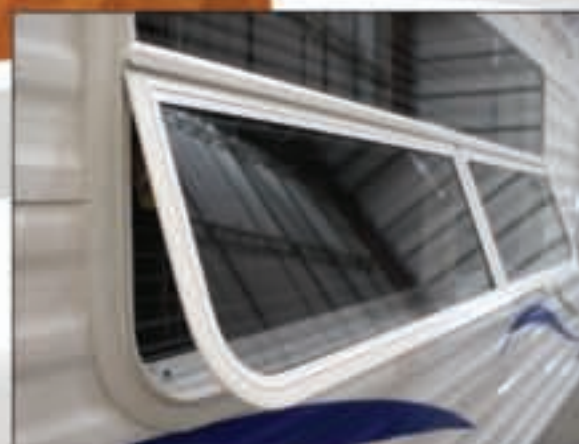
Crank out windows keep you dry while circulating fresh air