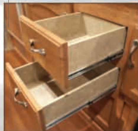
Lined drawers with roller bearing guides for ease and cleanliness