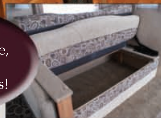
3 in 1 feature • from sofa to sleeper to extra hidden storage

Plenty of counter space, storage & conveniences!